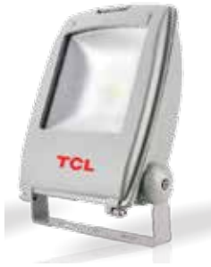
50W FLOOD LIGHT