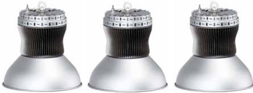
80W HIGH BAY

FACTORIES, WAREHOUSES, SHOPPING MALLS, SUPERMARKETS, AIRPORTS, STADIUMS, STATIONS, EXHIBITION HALLS, ETC