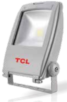
80W FLOOD LIGHT

PATH LIGHTING, BUILDINGS, SCULPTURES, BILLBOARDS, PARKING LOTS, DOCKS, GARDENS, ETC.