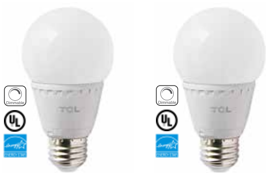
A19 7W & 10W 2700K

FOR USE IN HOME INTERIOR, LIVING ROOMS , BEDROOMS , HALLS , SHOW ROOMS & BARS, DINNING ROOMS, CORPORATE OFFICES, GOVERNMENT & STATE FACILITIES, RETAIL OUTLETS, GAS STATIONS, RESTAURANTS, HOTELS , RESORTS & SPAS